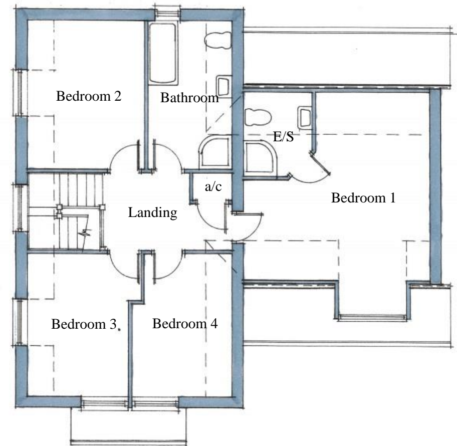
First Floor Layout